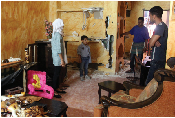
A family examining the havoc wreaked by soldiers on its home at Balata Refugee Camp, June 17, 2014.

Similar use of home invasions as a deterrent is made in search and arrest raids conducted in response to stone-throwing or attacks and attempted attacks on Israeli soldiers or civilians. Invading homes without concrete suspicions against any of the occupants is an element of military action designed to deter and sow fear in the community, and in some cases, collectively punish an entire community for the actions of individuals.