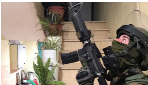
Soldiers invade the Tamimi family home in the village of Nabi Salah, August 23, 2020.

Consequently, home invasions may seriously impede daily functioning and the emotional and mental development of both adults and children. In addition, frequent home invasions in a specific area (a city, village or neighborhood) may also interfere with relationships within society or the community and produce a climate of fear and intimidation.