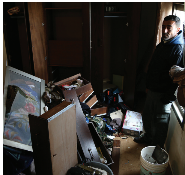
Destruction and mayhem following a home invasion in the village of Iraq Burin, March 17, 2016.

The secondary importance the military ascribes to protecting Palestinians' rights when intruding into their homes is reflected in the absence of binding, publicly accessible directives on protecting these rights, such as directives intended to prevent arbitrary damage to property. It is also reflected in soldiers and officers' lack of familiarity with directives concerning the protection of minors when their homes are invaded or when they are arrested. Without such directives, the extent to which the rights of household members are violated varies according to the personality and whim of the commander on the ground.